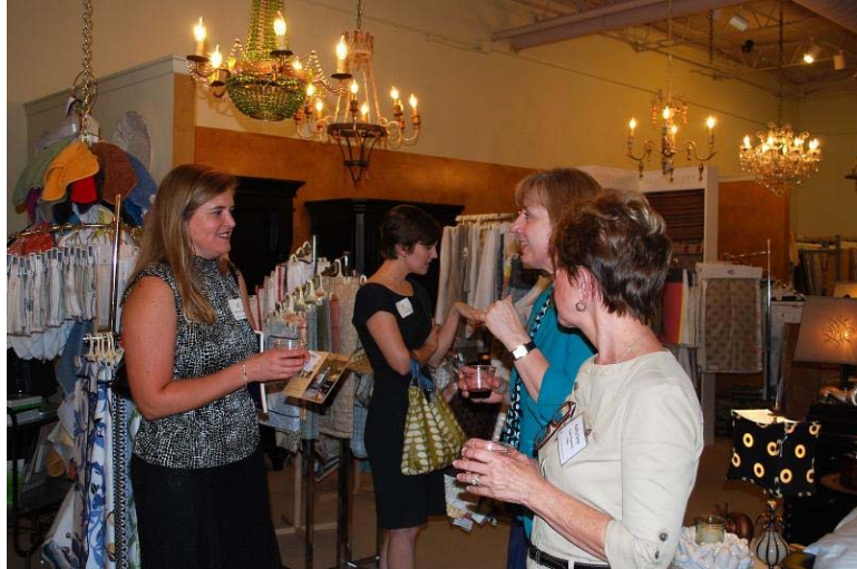
The September 2010 Community Coffee at Sonno Domestic Living

The exciting news is that we are going to do it again on November 10th at 6:30 p.m. Please join us for an evening of sharing and recruiting! If you and your friends cannot attend the Community Coffee, please check the Impact Austin website for dates of coffees in our members' homes.